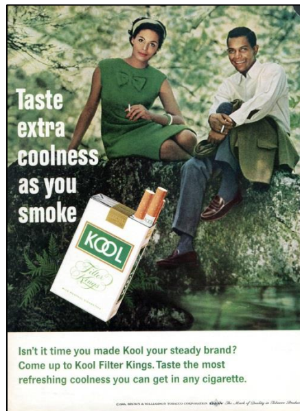
Kool advertisement, 1966

Brown & Williamson took to the airwaves to market Kool, with an advertising budget exceeding that of the other tobacco companies in the 1960s. During this time, cigarette advertisements, many featuring famous black athletes, tripled in Ebony . 7 The aggressive marketing campaign had a huge impact - from just 1968 to 1976, the percentage of Black Americans smoking Kool jumped from 14 percent to 38 percent, with even greater preference for Kool among young African American males. 8 An R.J. Reynolds analyst noted that, “Kool became ‘cool’ and, by the early 1970s, had a 56% share among younger adult Blacks—it was the Black Marlboro.” 9 Salem’s successful initial promotion of