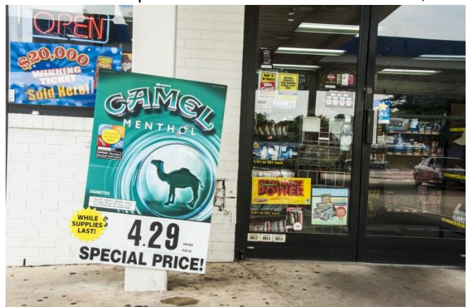
Price promotions for Camel cigarettes in Durham, NC.