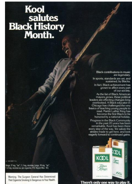
Kool advertisement, 1984

The tobacco companies also recognized the value of associating their brand with popular community events.